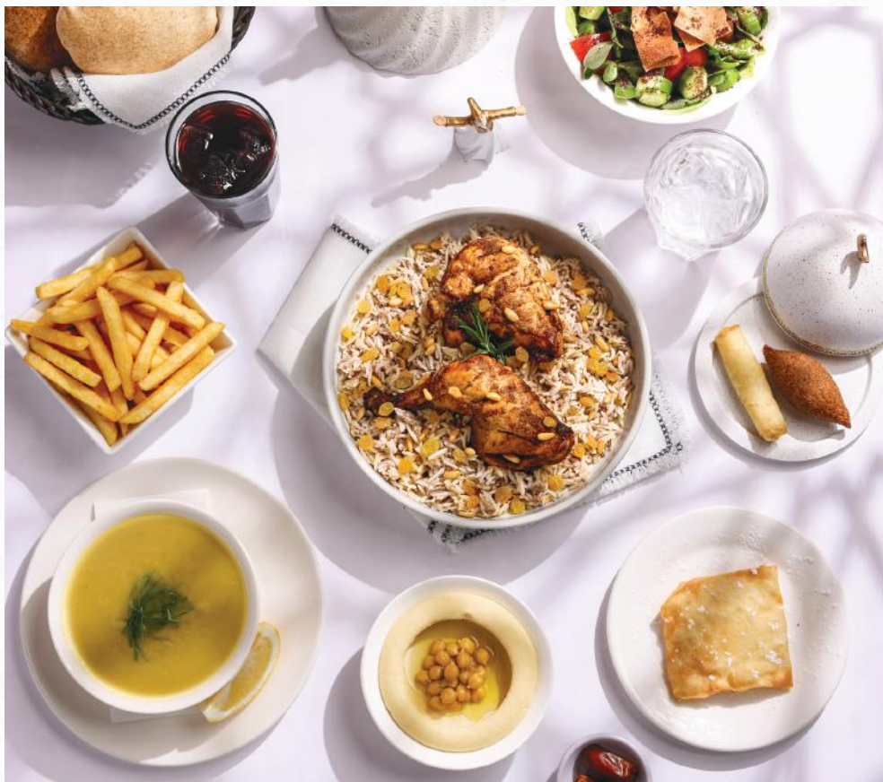
Oriental Rice with Chicken Offer

Kebbeh with Laban and Rice with Lentil Soup, half portion Fattouch, side Hommos, French Fries, 1 pc of Cheese Rakakat. 1 pc of Fried Stuffed Kebbeh, 2 pcs of Dates, 1 pc of Tamrieh, Jellab, Small Water, and bread