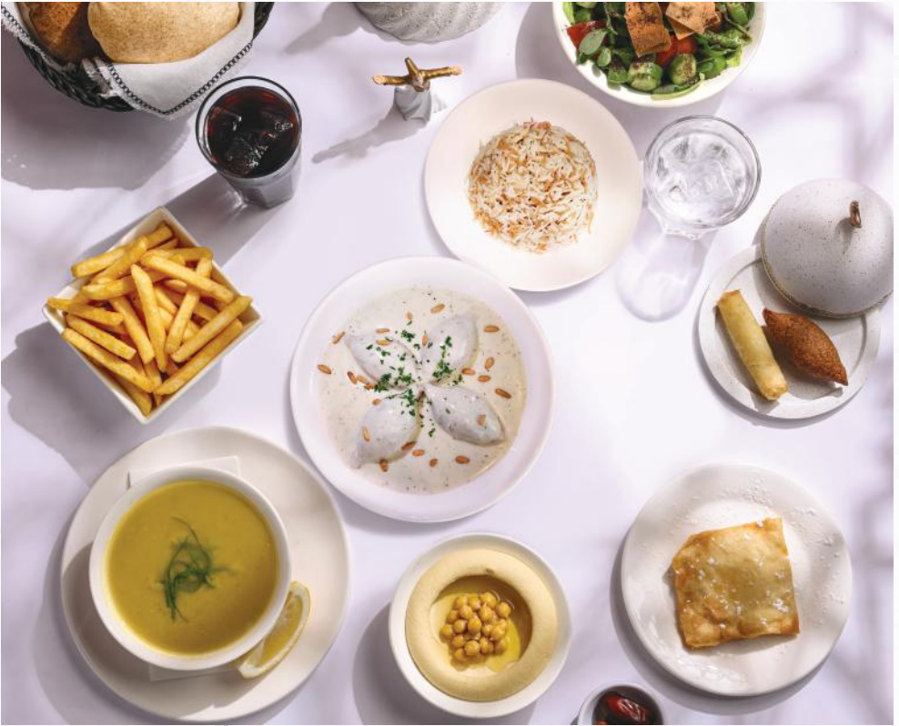
Kebbeh bel Laban Offer