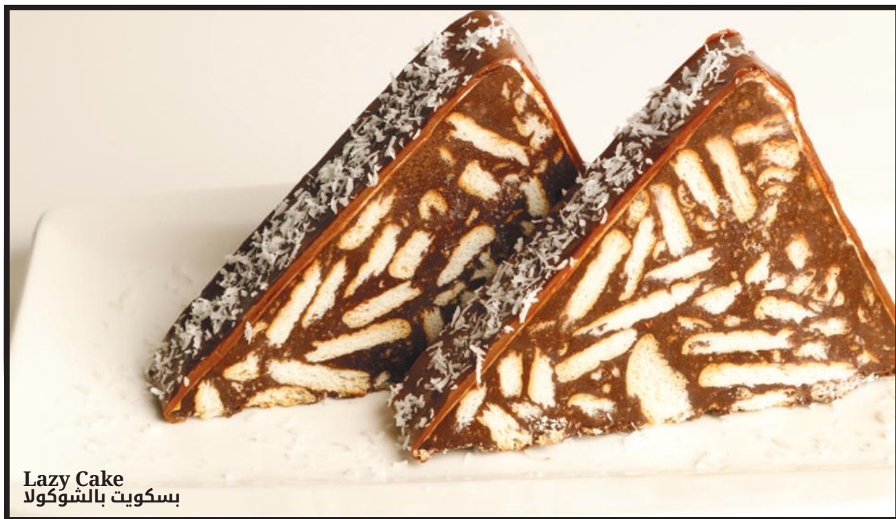
Lazy Cake بسكويت بالشوكولا