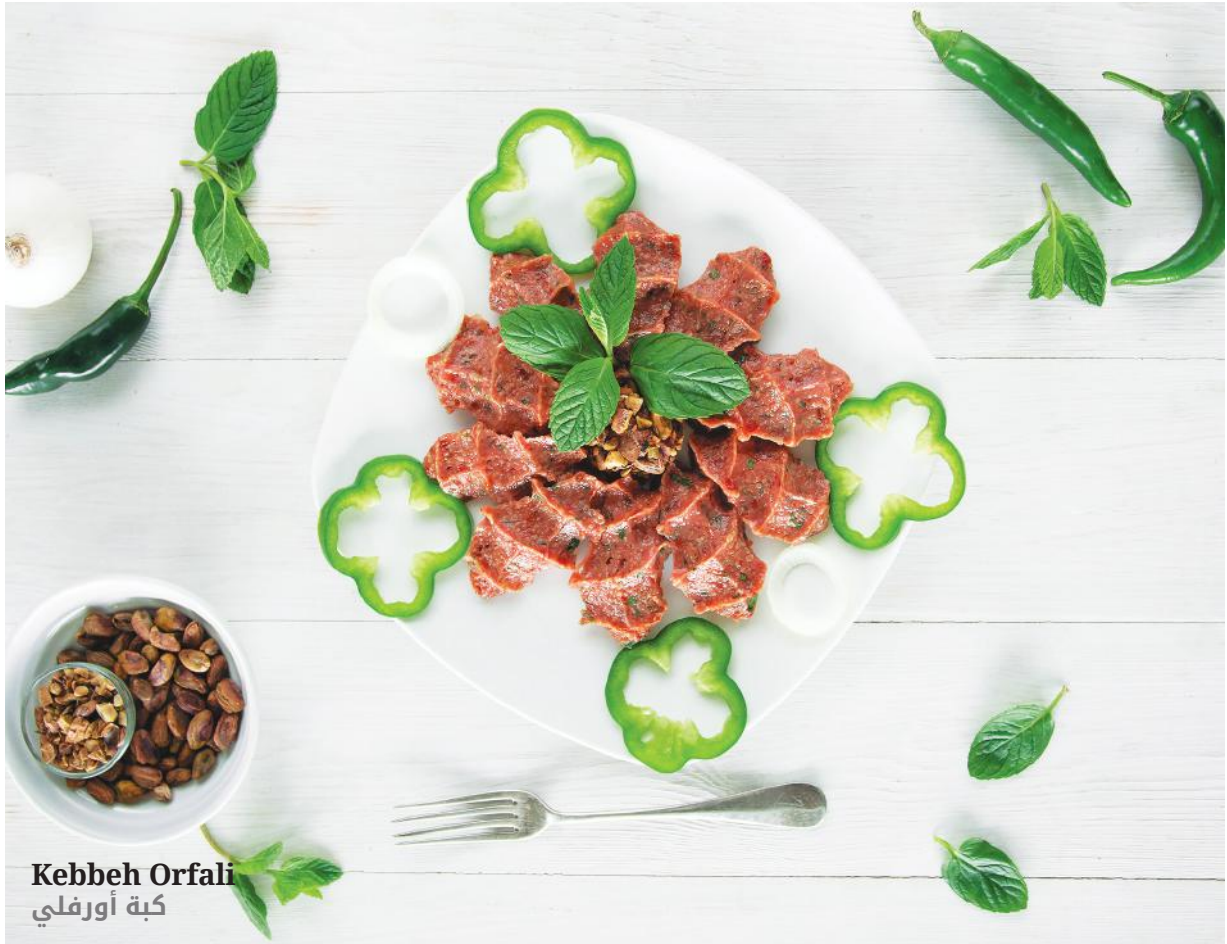
Kebbeh Orfali كبة أورفالي