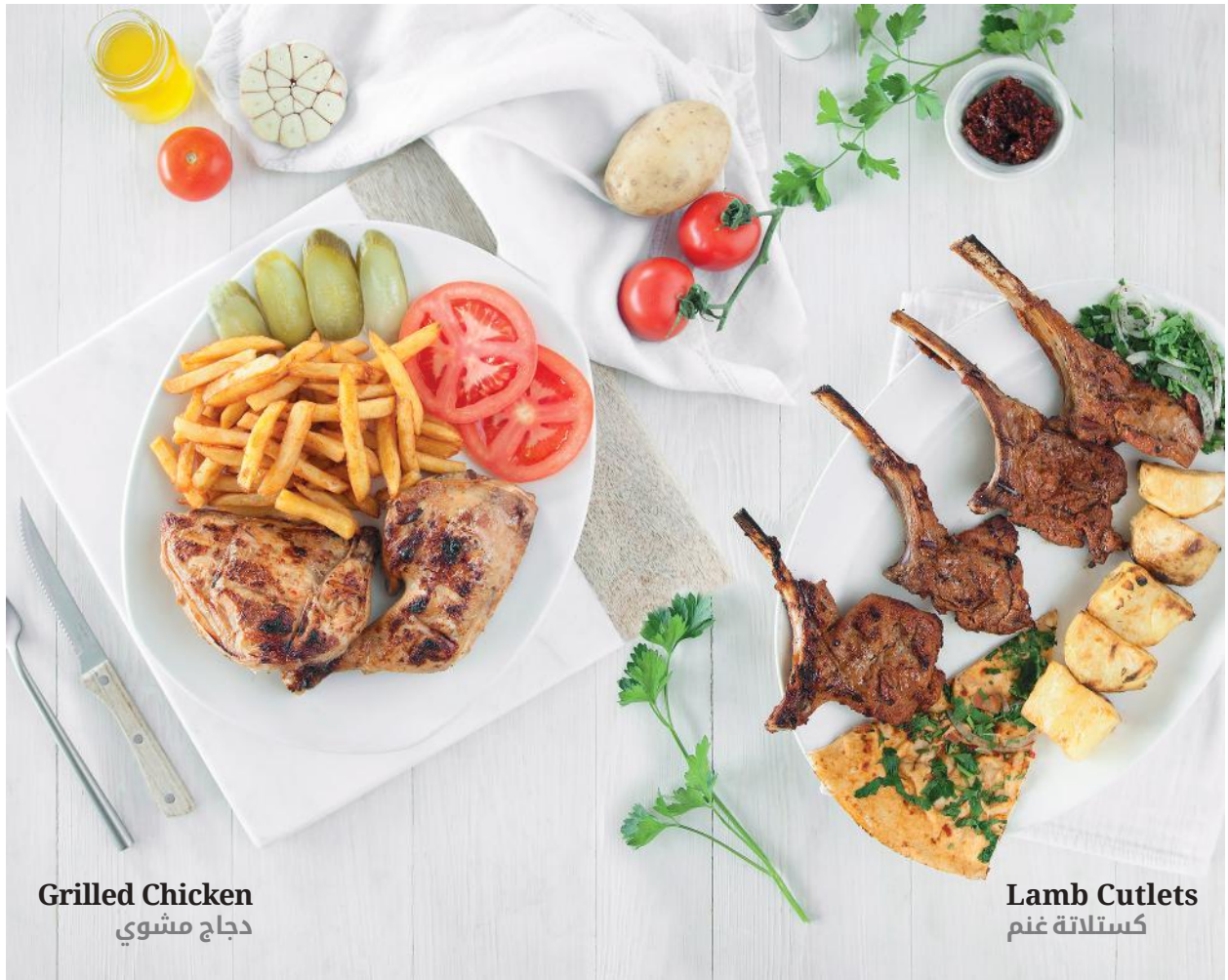
Grilled Chicken دجاج مشوي