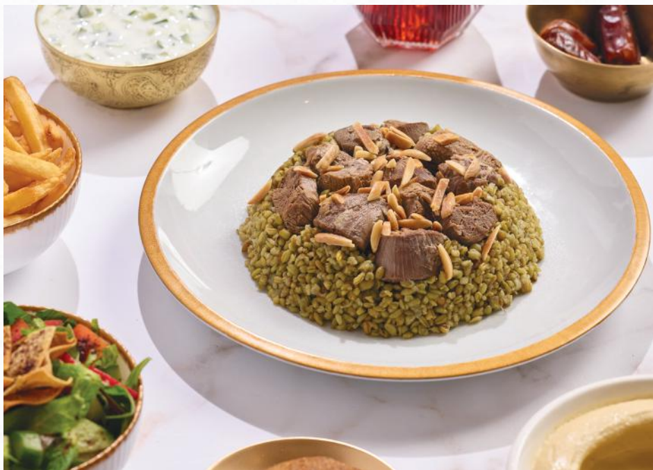
Frikeh with Lamb Meat

Frikeh with Lamb Meat with your choice of Aadas bi Hamoud or Pumpkin Soup, half portion Fattouch, side Hommos, French Fries, 1 pc of Fried Stuffed Kebabeh, 3 pcs of Dates, 1 pc of Mouhalabieh, bread, Small Water, and your choice of Jellab, Fresh Juice, or Soft Drink