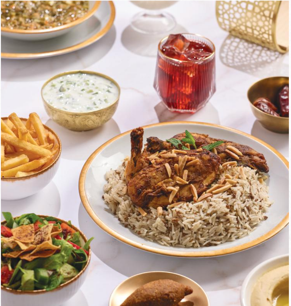
Oriental Rice with Roast Chicken Meal

Oriental Rice with Roasted Chicken with your choice of Aadas bi Hamoud or Pumpkin Soup, half portion Fattouch, side Hommos, French Fries, 1 pc of Fried Stuffed Kebabeh, 3 pcs of Dates, 1 pc of Mouhalabieh, bread, Small Water, and your choice of Jellab, Fresh Juice, or Soft Drink